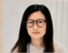
Meishu Piao OLYMPUS CORPORATION